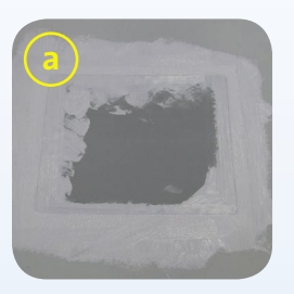
a. Brush on compound and lay outlet sleeve on top