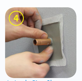
4. Apply Pipe Sleeves