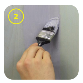
2. Apply Tape