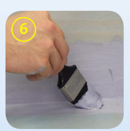
6. Finish by applying 2-3 coats of Compound over the entire area \,