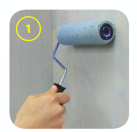
1. Apply Primer

How to install the Aquaproof Tanking System