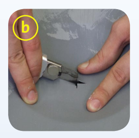
b. When dry, cut an 'x' with a knife in the centre