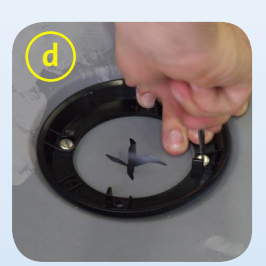
d. Secure the clamping ring with screws